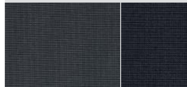
Mondus Max in Fairland seat facing, Mondus Max in Syracuse seat sides (Base and Trend)