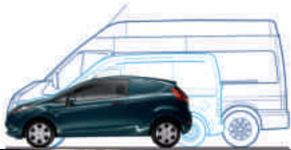
Model: Fiesta Van Trend