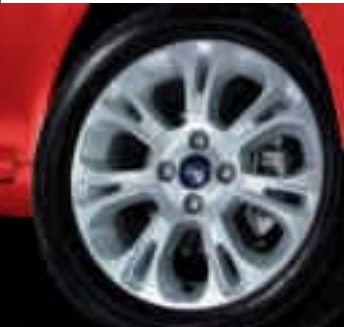
15" 7x2-spoke Silver alloy wheel Option on Zetec, or as an accessory on all models.