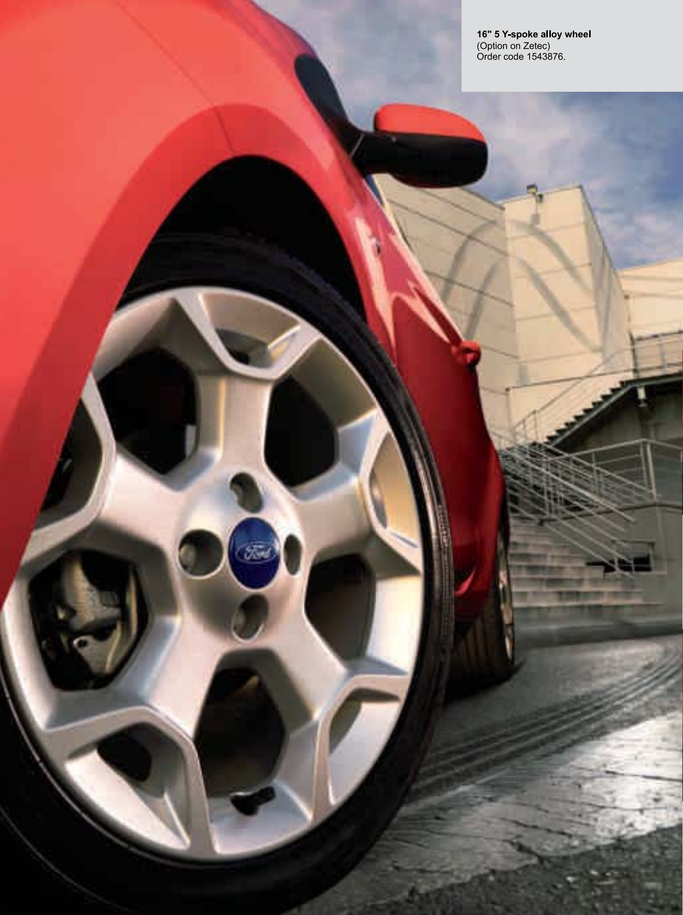
16" 5 Y-spoke alloy wheel (Option on Zetec) Order code 1543876.