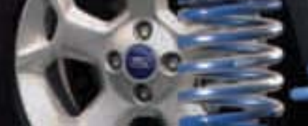
Eibach suspension-lowering kit Enhances driving performance and handling as well as giving a more sporty appearance. Lowers the car by approximately 30 mm. (Accessory)

Make a bold statement with your choice of stunning alloy wheels – available as part of the Appearance Pack. You can also have fun combining them with the many options available for the Ford Ka.