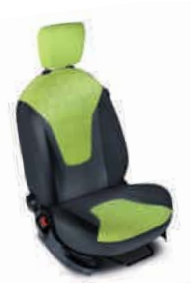
Unique Digital seat fabric design Shown in Syracuse / Lime fabric.