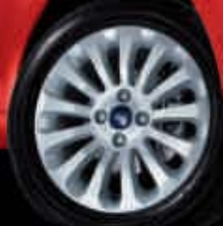
15" multispoke alloy wheel (Standard on Zetec) Also available as an accessory on all models