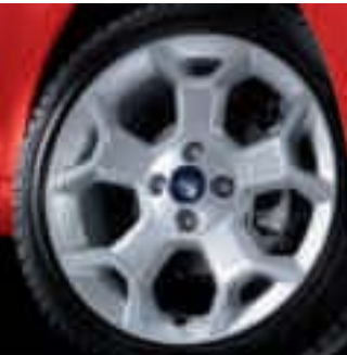
16" 5 Y-spoke alloy wheel Option on Zetec, or as an accessory on all models.