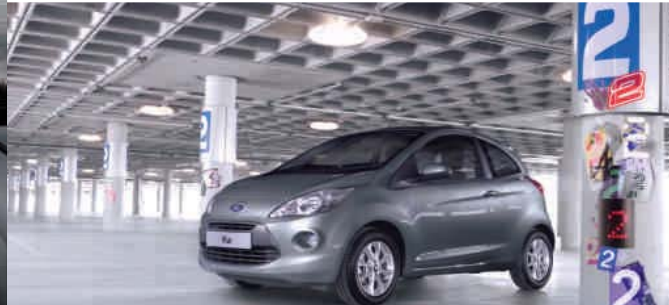
Image above: Model shown is a Ford Ka Style with Strobe metallic paint (option) and Appearance Pack (option).