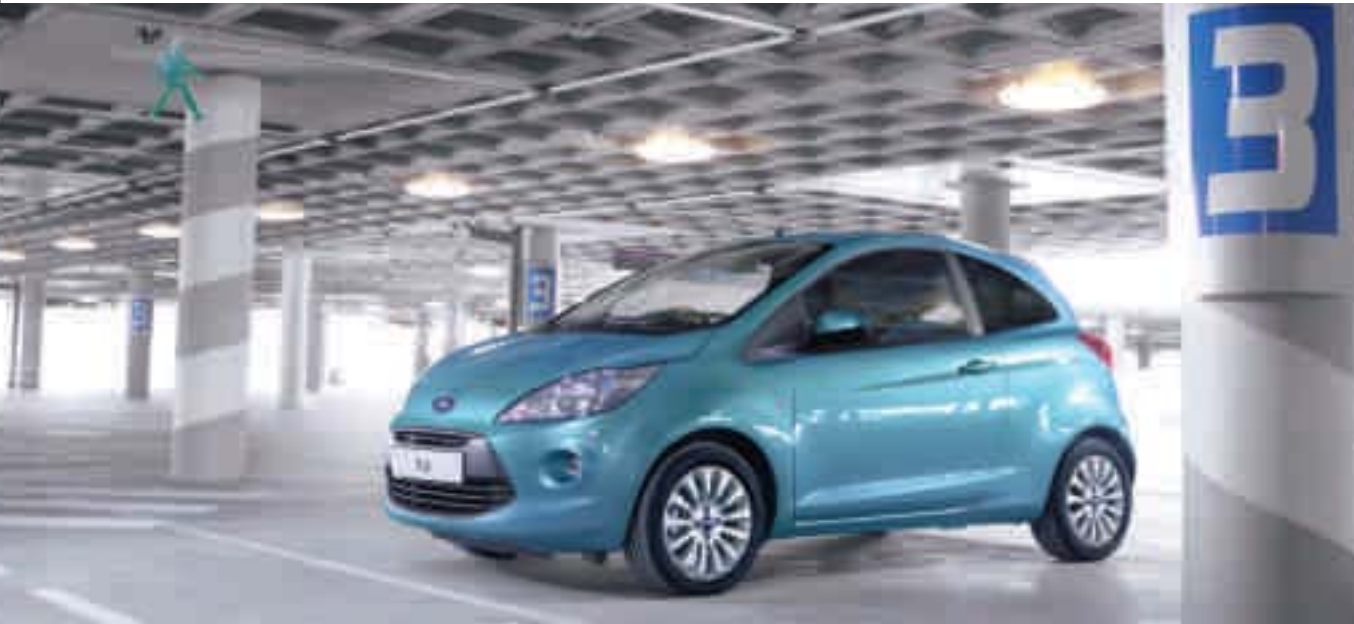
Image above: Model shown is a Ford Ka Zetec with Scuba metallic paint (option).