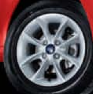
14" alloy wheel Available as part of 14" Style Pack with front fog lights on Style and Style+ (option) or as an accessory on all models.