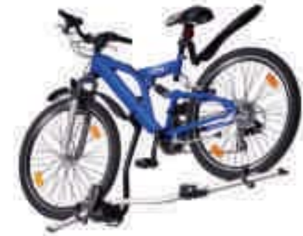
Thule bicycle carrier attachment (Accessory)