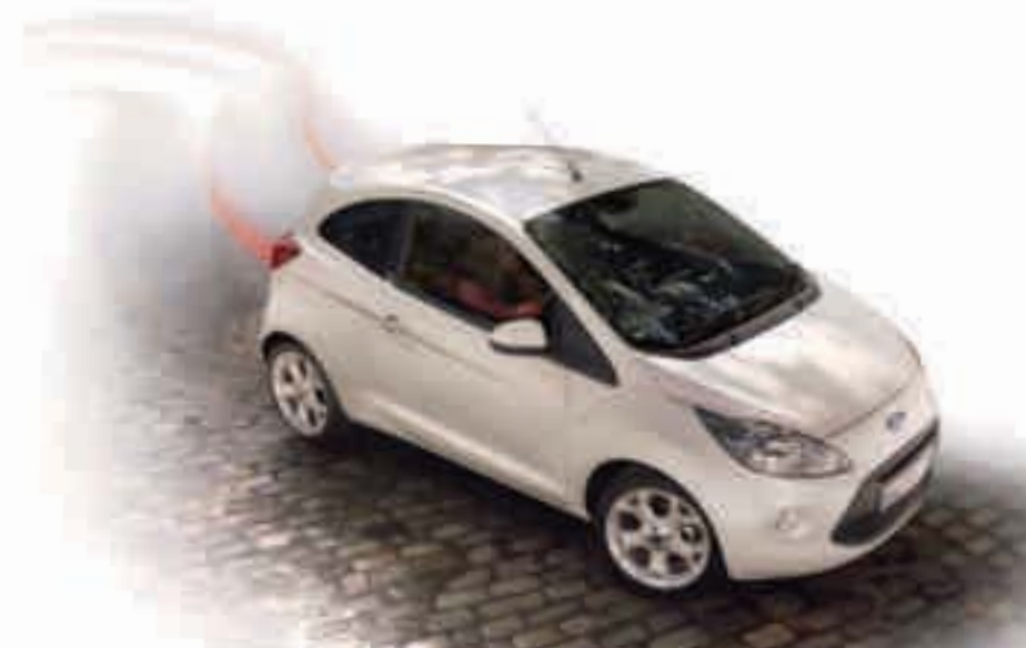
Image opposite: Model shown is a Ford Ka Zetec with Sunrise paint and 16" Alloy Wheels (option).