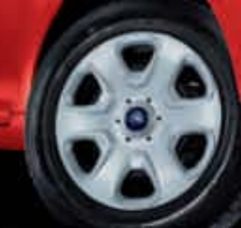
14" steel wheel with 6-spoke wheel cover (Standard on Studio, Style and Style+)

Make a bold statement with your choice of stunning alloy wheels – available as part of the Appearance Pack. You can also have fun combining them with the many options available for the Ford Ka.