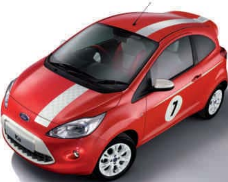
Image left: Model shown is a Ford Ka Zetec with Grand Prix Individual Interior Pack (option), EATC (option), Bluetooth and USB (option) and ESP (option).

Image right: Model shown is a Ford Ka Zetec in Sunrise with White Grand Prix Individual Exterior Pack (option) and 15" 7-spoke White 15" alloy wheels (accessory).