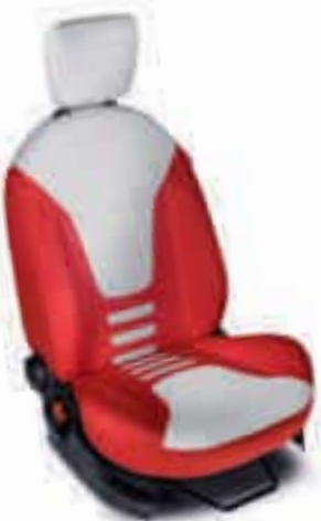
Unique Red and White seat fabric design

*Available in White for Sunrise, Disco, Strobe and Cloud; and in Sunrise for Crystal and Piste.