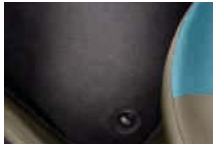
Premium steering wheel with Pearl White insert (Standard) Image shown with optional Bluetooth®