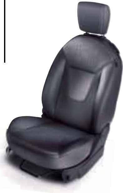
Unique leather seat design Shown in Syracuse leather with pearlescent detailing.