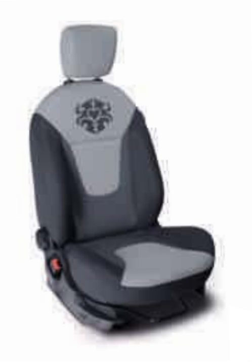
Unique seat fabric design and door trim Seat shown in Syracuse / Silver-Grey fabric. Door trim shown in Syracuse with Silver-Grey fabric insert and Pearl White door handle insert.