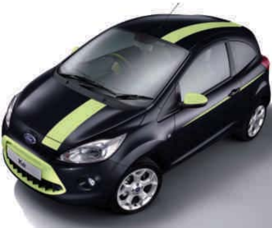
Image right: Model shown is a Ford Ka Zetec with Disco metallic paint (option), Digital Exterior Pack (option) and 16" 5 Y-spoke alloy wheels (option). Image opposite : Model shown is a Ford Ka Zetec with Digital Interior Pack (option), ESP (option), EATC (option) and Bluetooth® and USB (option) Note Digital Exterior Pack and Digital Interior Pack available on Zetec models only.

Lime leather / aluminium-look gear knob with Syracuse vinyl gear lever gaiter and Lime contrast stitching Also available as an accessory