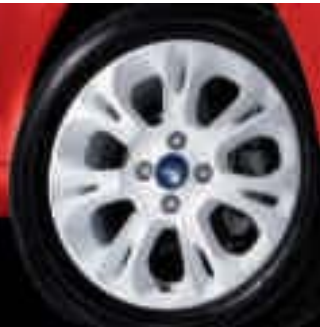
15" 7x2-spoke White alloy wheel Available as an accessory on all models.